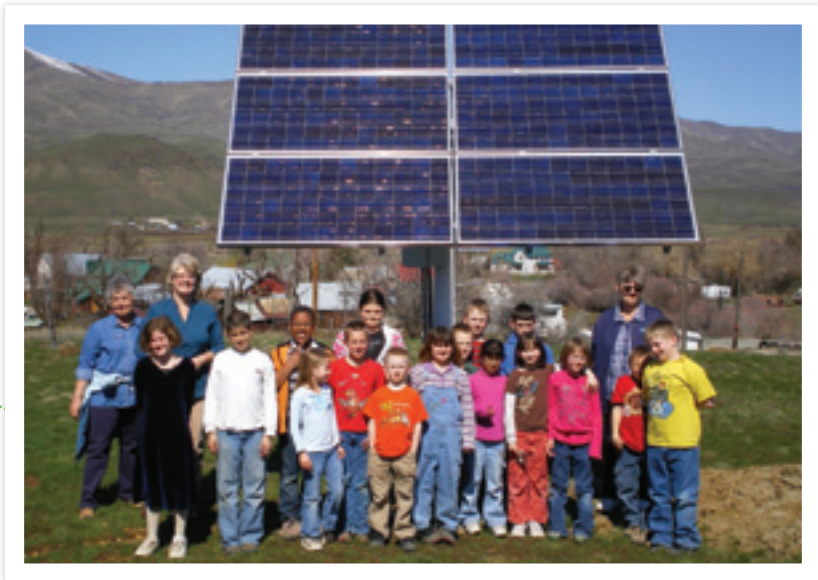
Ola Elementary, Ola Idaho, with their BEF and Idaho Power Solar 4R Schools solar array.

Because we're a 501(c)(3) nonprofit, our net revenues are reinvested in environmental programs dedicated to the promotion, financing and development of new sources of renewable energy, renewable energy education programs and watershed restoration projects. In short, BEF's RECs take your environmental dollars further.